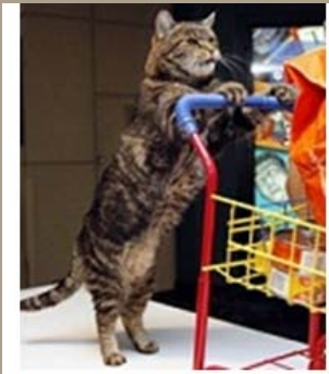
Supply of the Month

For details of all events check the Events Web Page