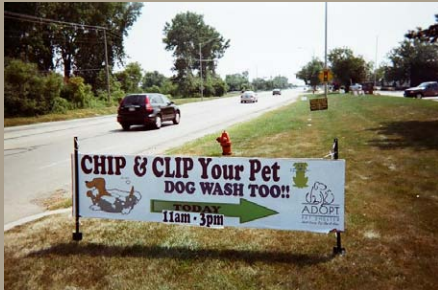
Chip Clip and Dip

A.D.O.P.T. Pet Shelter 420 Industrial Drive Naperville, IL 60563 630-355-2299 www.adoptpetshelter.org